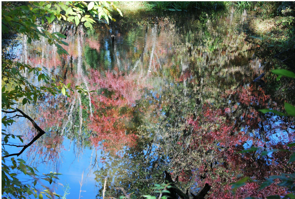
Autumn colors of the South Grand property reflected in still waters