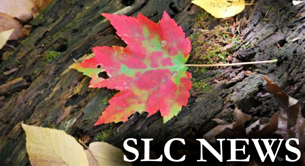
Newsletter for SLC Members